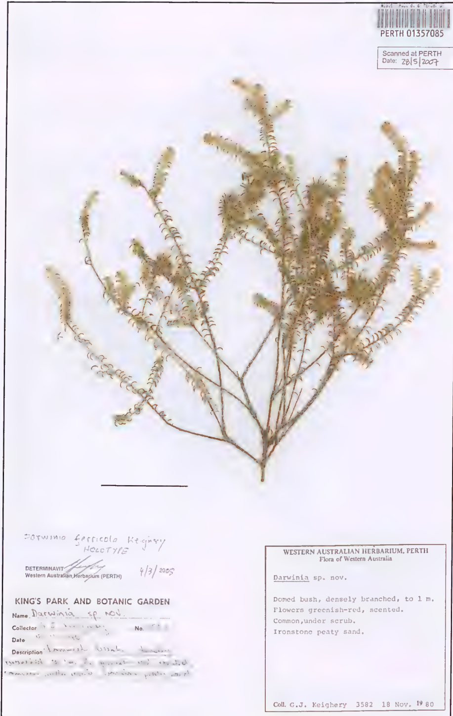
Figure 4. Holotype of Darwinia ferricola , scale = 5 cm.